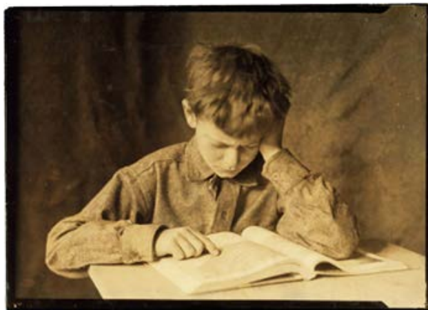
Boy Studying, by Lewis Hine