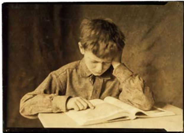
Boy Studying, by Lewis Hine