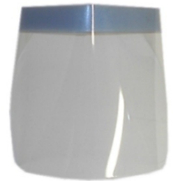
Disposable shield mask